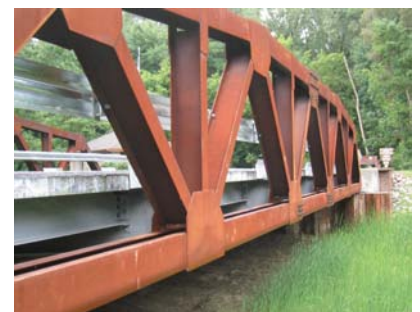
Union Street Bridge - Sporting a Rustic Weathering-Steel Finish (bottom right)

North Channel were also necessary. A FEMA Flood Hazard Mitigation grant was awarded for construction of the Union Street Bridge on the North Channel.