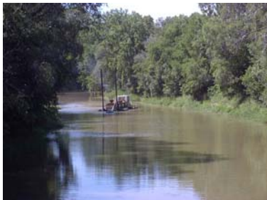
Dredging the Sebewaing River

The U.S. Army Corps of Engineers and the Sebewaing Harbor Commission routinely dredged the