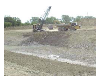
Constructing the State Drain Sediment Basin

These elements were constructed in 2004 and 2005 for $2.2 million. Over $0.6 million in grant funds were secured from FEMA and MDEQ, reducing the cost to the drainage districts by over 28 percent. Project goals focused on water quality concerns and serious flooding issues.