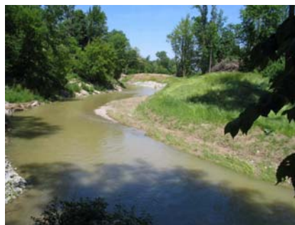
BMP: Channel Cleanout (one-sided construction with selective clearing, retaining meanders) – State Drain

Restoration of the lower end of the State Drain was a delicate matter. ICDB team-members worked early in the project to discuss the "natural" approach to construction on the drain with