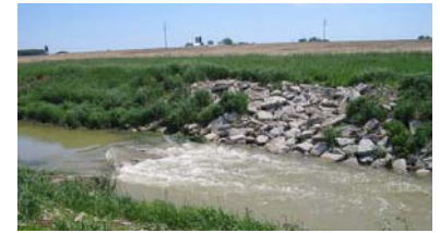
BMP: Rock Check Dam – Columbia Drain

The Columbia Drain had actually begun to heal itself from the conditions noted during the initial study. As work proceeded, the grade control and channel pullback called for in the design worked wonders on the battered channel. CMI grant funding was secured for in-channel BMPs on the Columbia Drain that went above and beyond traditional maintenance work and were accepted by the MDEQ for the improvement of water quality.