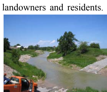
BMP: Rock Ford Crossing – State Drain

landowners and residents. These early efforts were rewarded with citizen support. Low-flow meanders and trees were to remain and meanders were protected with tree revetments. This