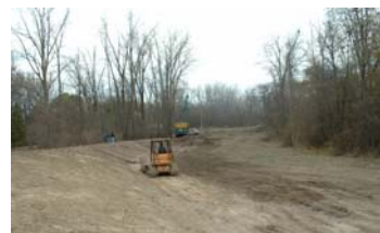
Widening the Old North Channel

The Old North Channel, downstream of the Village of Sebewaing, was the original outlet of the Sebewaing River into Saginaw Bay. The