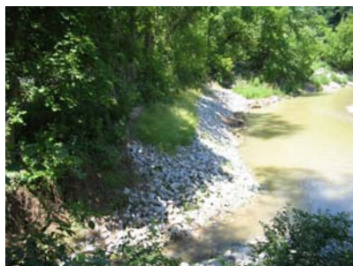
BMP: Rip Rap Slope Protection – State Drain

integrated with the dynamics of ice formation and jamming to minimize ice block thickness and overall size at breakup; floating ice is trapped upstream of the downtown Sebewaing area. CMI grant funding