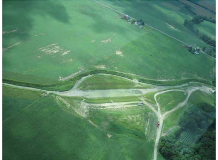
Aerial View of Columbia Drain Sediment Basin

Though a watershed study was completed in 1995, no action was taken. Then, on the heels of another ice-jam induced flood event, the Village of Sebewaing petitioned for relief in 1997. The Sebewaing River Intercounty Drainage Board